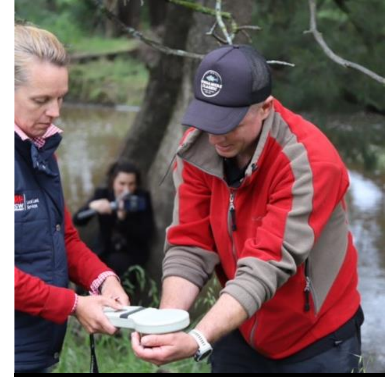
Local Land Services working with NSW Fisheries reading tags on Macquarie Perch prior to release in the Riverina region