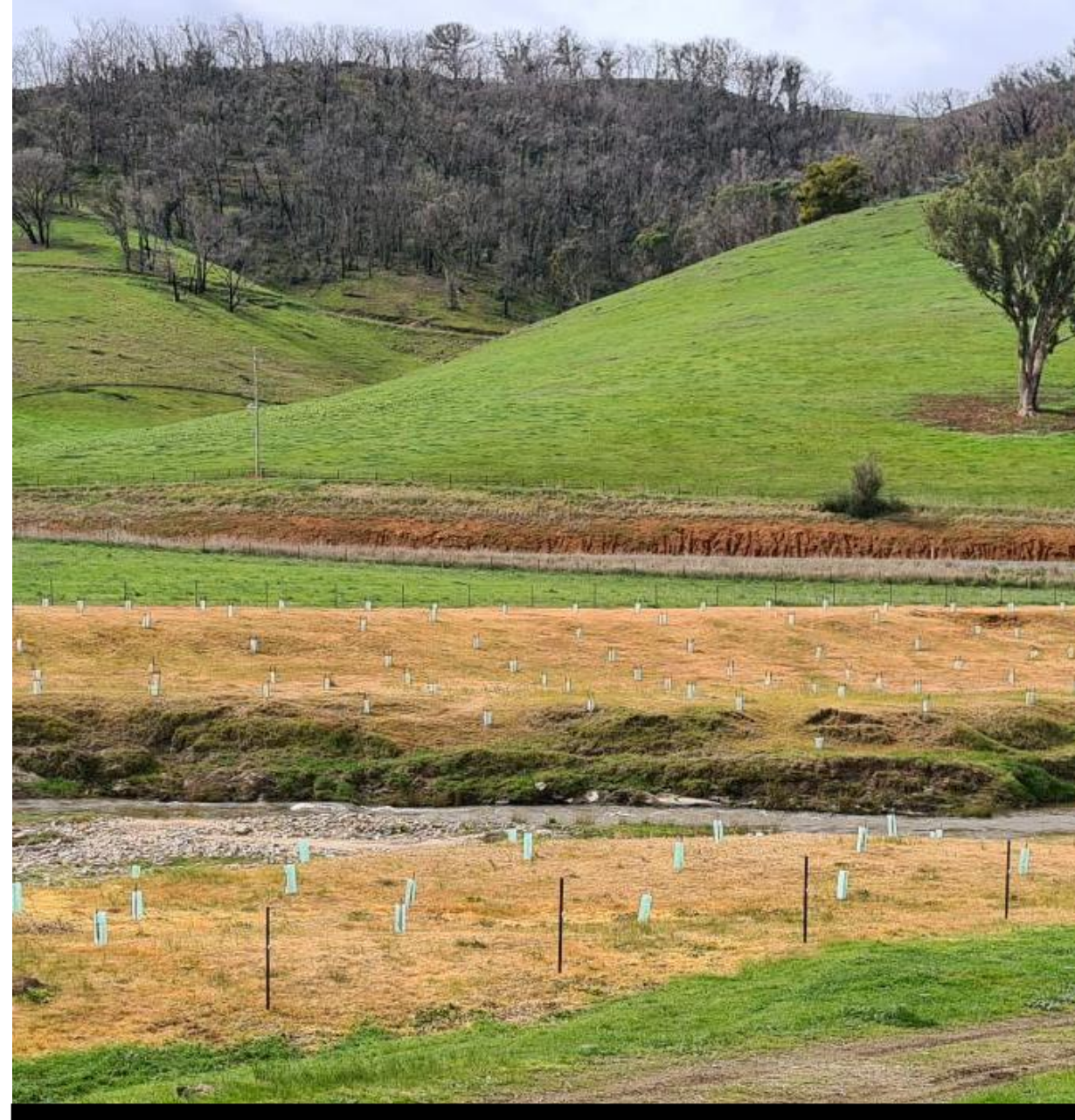
Riparian revegetation program targeting a high value waterway to protect Booroolong Frog habitat in the Murray region