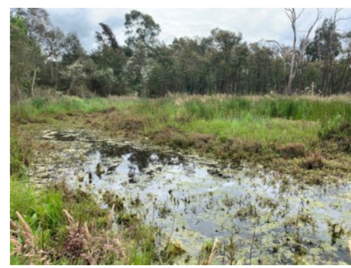
Enhancing Our Dandenong Creek restoring nature corridors and waterways in southeast Melbourne

Urban natural resource management encompasses revegetation, restoration of urban rivers, creeks, wetlands and riparian areas, supporting urban and peri-urban biodiversity and waterways, and partnerships with Traditional Custodians to care for culture and Country. NRM organisations also work with managers of urban green spaces (such as golf clubs), to manage and restore habitat, reduce weeds, pests and disease, and improve the quality of water courses and wetlands.