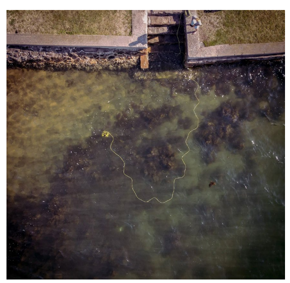
Developing an assessment and approach to preventing litter accumulation on seabeds by reducing estuarine waste

The NRM sector delivers cross-regional and cross-program integration for management of marine systems, delivering integrated outcomes from funding from multiple levels of government, industry and private sources. Many NRM regions undertake work to maintain healthy estuaries and coastal waterways to prevent or reduce impacts on marine environments, working with partners including Traditional Owners, state/territory and local governments, industry and communities. NRM organisations also work with landholders and across tenures to reduce