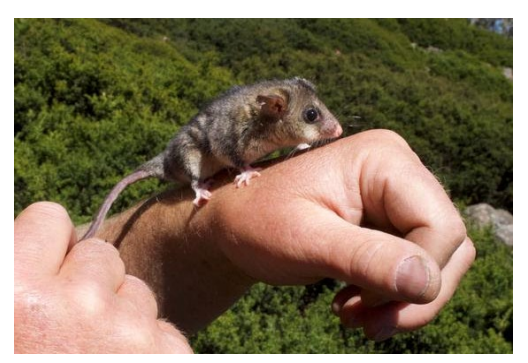
Monitoring of two Mountain Pygmy Possum groups connected by an under-road tunnel in Alpine Victoria shows restoration of gene flow between

Regions also deliver an array of specific actions to protect and recover threatened species and ecological communities in the landscape. This includes restoring key vegetation and habitat features, protecting refugia, recovering waterways, providing artificial habitat, and managing and testing appropriate fire regimes for ecosystems and species of concern. The sector also plays a key role in supporting the recovery response for biodiversity to extreme events, underpinned by