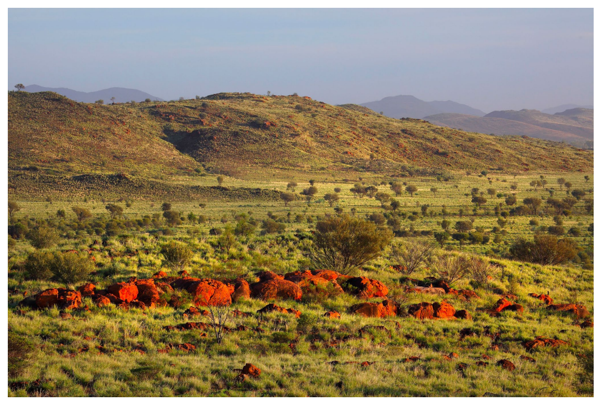
Anangu Pitjantjatjara Yankunytjatjara lands, South Australia