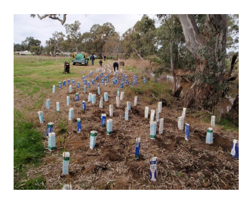
Restoration plantings support carbon sequestration while delivering benefits for biodiversity, landscapes and communities