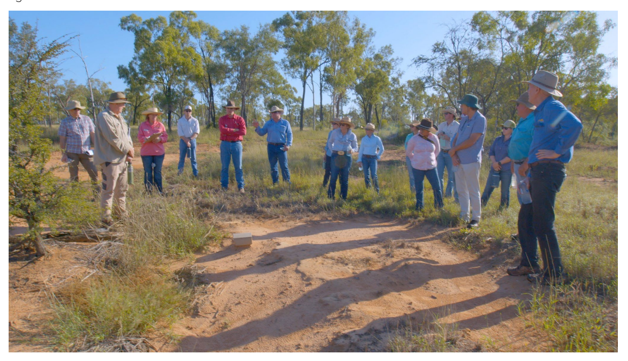
Field day at Hells Gate pastoral station, North Queensland

Landscape-scale approaches: "Biodiversity conservation has rapidly shifted in recent decades to embrace landscape-scale conservation planning, which aims to support biodiversity alongside agricultural and other human land uses ..."