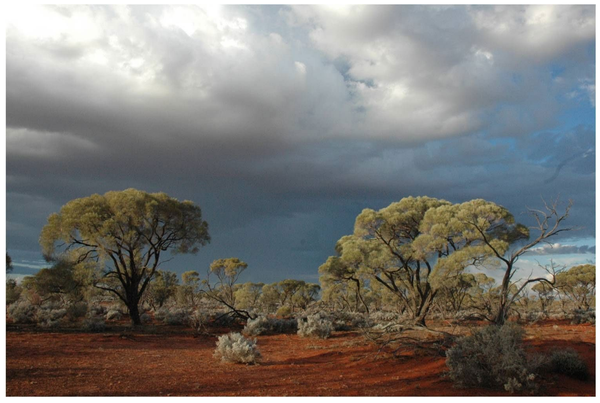
Yellabina regional reserve, South Australia

Below-ground biodiversity: "Below-ground organisms comprise a large fraction of global terrestrial diversity and are responsible for essential ecosystem functions and services, such as plant productivity, nutrient cycling, organic matter decomposition, pollutant degradation and pathogen control"