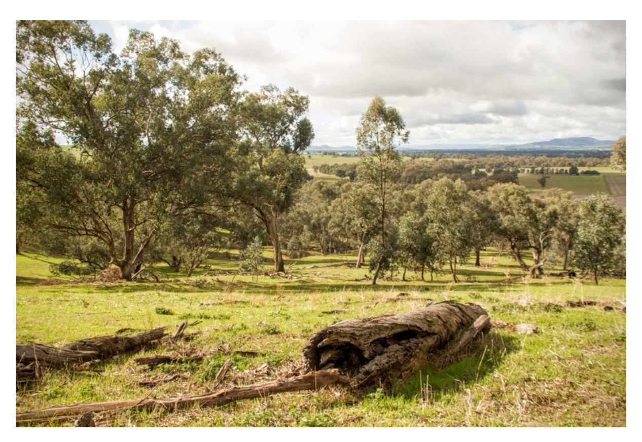
Native vegetation at a travelling stock reserve helps support landscape health and biodiversity connectivity

Australia's NRM sector is a critical piece of national infrastructure capable of helping turn this around. This report highlights where and how, touching on key findings from the SoE report, and how they articulate with the capabilities, capacity and potential of NRM to make future SoE findings a story of success.