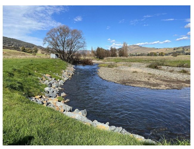
Streambank works to prevent erosion following 2019-20 wildfires near Gilmore NSW

NRM organisations are a key element of our national infrastructure for securing our landscapes and waterways against the impacts of climate extremes and natural hazard disasters. They work across their regions to identify priority actions for mitigating risks from climate extremes and natural hazards, and embed ecological, landscape-level and community resilience. This includes actions to mitigate natural hazard risks, such as streamflow and wetland restoration to reduce flood risk, coastal vegetation to mitigate storm surge impacts, support for cultural land and fire management, and national adaptation infrastructure to protect productive land