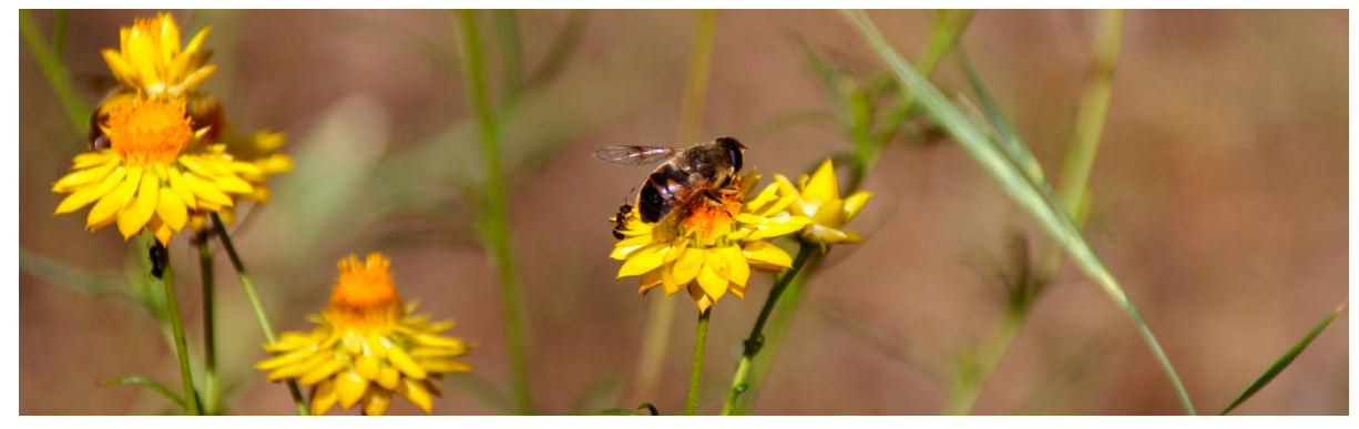
Natural resource management provides benefits across sectors and landscapes. These native bees on paper daisies in Corowa NSW are contributing pollinators for agricultural industries.