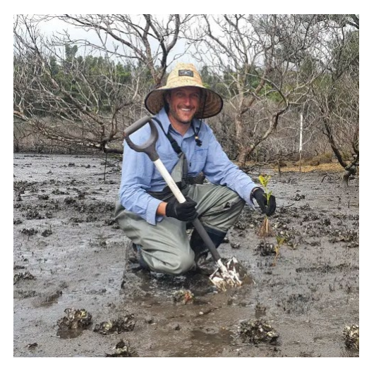
OceanWatch Australia mangrove forest recovery project to protect coastlines after bushfires