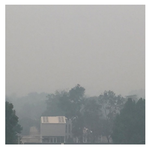
Bushfire smoke haze over Canberra Jan 2020

Bushfires: "A warming climate will increase pressures on air quality... The summer of 2019–20 produced one of the worst bushfire seasons on record ... Smoke blanketed towns and cities in Australia for many weeks, with concentrations of PM2.5 (particulate matter with a diameter of 2.5 µm or less) well above air quality limits ... about 80% of the Australian population was affected... The costs to health ... have been estimated at 417 excess deaths across Australia, 1,124 hospital admissions for related cardiovascular problems, 2,027 hospital admissions for respiratory problems and 1,305 asthma presentations at emergency departments."