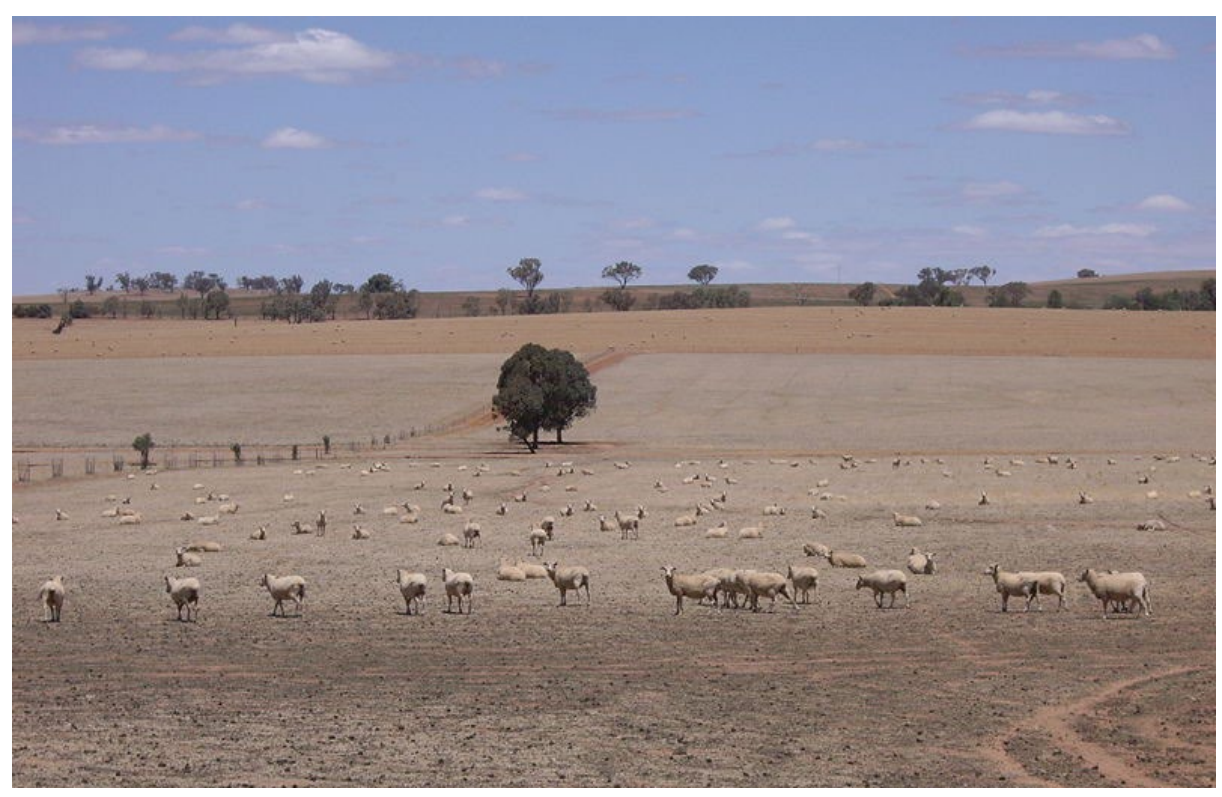
Revegetation, water retention and other NRM strategies can reduce risk of dust pollution in dry and drought conditions