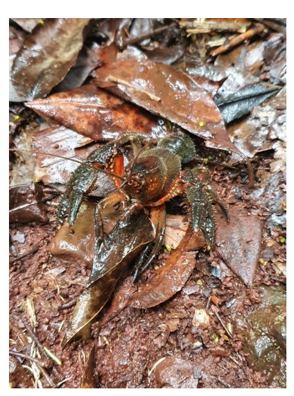
Spiny crayfish found in bushfire-affected Gondwana WHA

Heritage protection would also benefit from greater investment in: