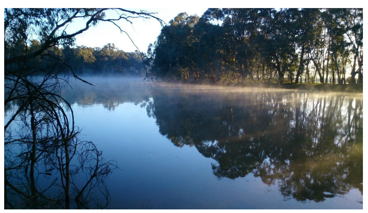
Mist on the water at Gunbower forest wetland, protected under the international Ramsar convention

Knowledge and protection gaps: "To ensure that Australian heritage is fully protected, resources to identify and research all types of heritage, encompassing all parts of our history, are needed ... Improved statutory recognition of the broad scope of heritage (i.e. intangible heritage, cultural landscapes and other landscapes, serial sites and objects) would provide more comprehensive heritage protection."