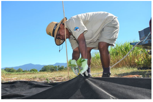
Riparian planting on Giru cane farm, North Qld

NRM work addresses a wide diversity of environmental values, reflecting this integrated approach. This includes improving the quality of water, soils, and vegetation, supporting sustainable production in agriculture, building community capacity to care for natural environments, mitigating the impacts of and responding to climate extremes and natural hazards, and protecting and restoring natural and cultural heritage areas, wetlands, threatened