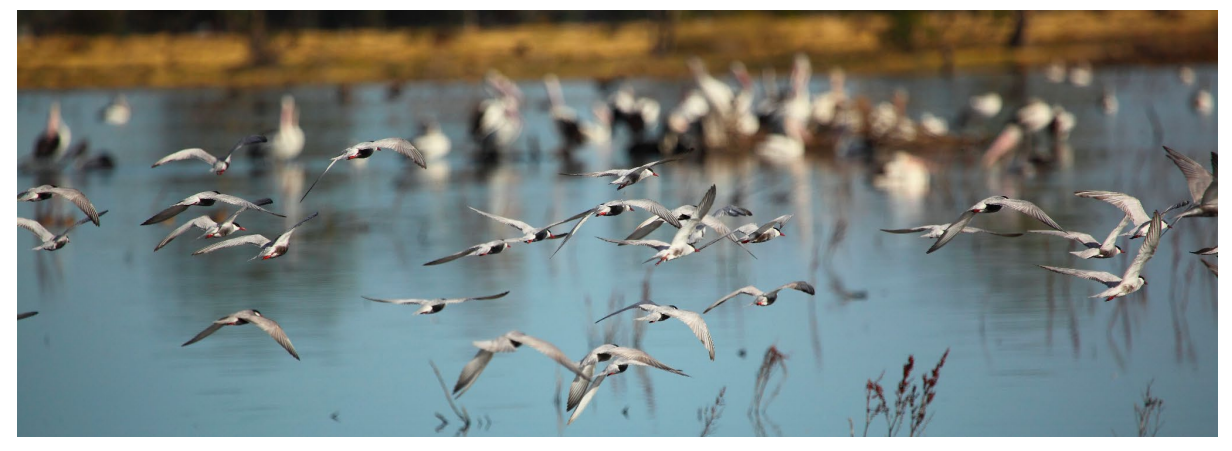
Whiskered tern, Lake Murphy, Victoria

All regional NRM organisations deliver actions to improve the health of waterways, and most include water in their regional planning. In some states, NRM organisations develop the annual watering plans around climate scenarios, working with water corporations to deliver environmental water to priority sites, and undertaking long-term intervention monitoring programs. The NRM regional model also supports water management across state boundaries such as the tri-state alliance.