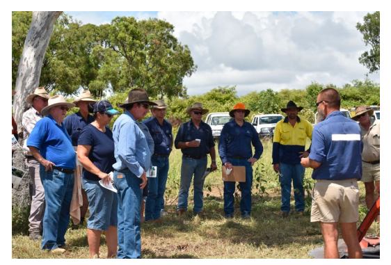
Woody weeds field day, North Queensland

and extension networks, including through Regional Agricultural Landcare Facilitators (RALFs). Taking an integrated landscape-level approach to natural and cultural values means that NRM organisations can be key partners in addressing landscape recovery as a whole, across tenures and actions, as well as protecting, managing and recovering particular high-value places and assets across landscapes.