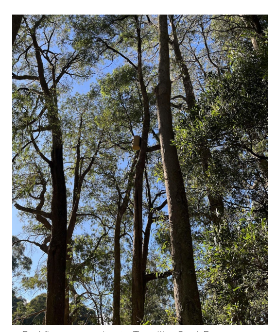
Bushfire recovery site at a Travelling Stock Reserve near Batlow, NSW. Nest boxes were installed to replace burnt out hollows for greater glider population