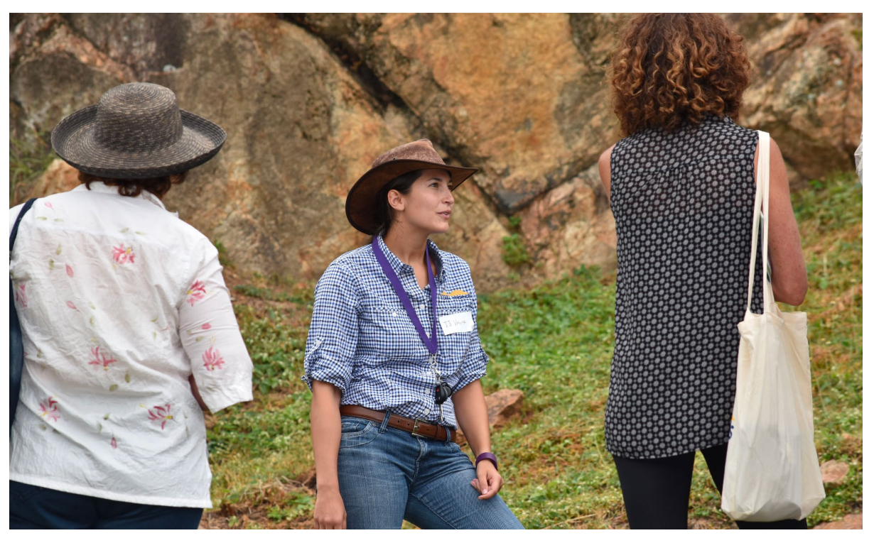
Native garden workshop, Townsville

Regions also help strengthen connections between urban, regional and rural areas through activities such as supporting participation in land care and catchment management activities and encouraging city residents to grow plants for revegetation of regional areas after wildfires.