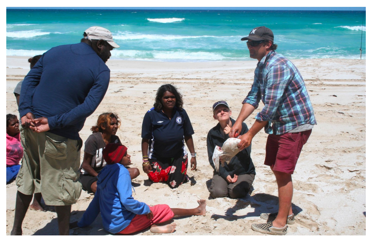
Mulloway tagging at Yalata Beach, South Australia