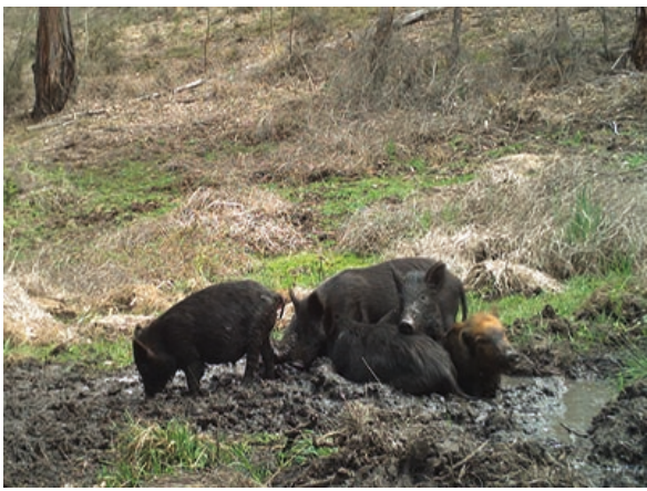
Local Land Services near Greater Blue Mountains WHA work with park managers to deliver cross-tenure pest animal control to reduce impacts on the WHA and surrounding

Policy recognition of the importance of NRM in helping protect and recover heritage areas after extreme events