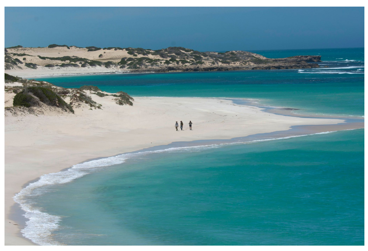
Shorebird surveys Far West Coast SA

Importance of coastal restoration: "Restoration and conservation of coastal ecosystems (e.g. mangroves, saltmarsh, and shellfish reefs) can offer physical protection from extreme weather events and erosion, with additional benefits of enhanced biodiversity, and ecosystem function and services."