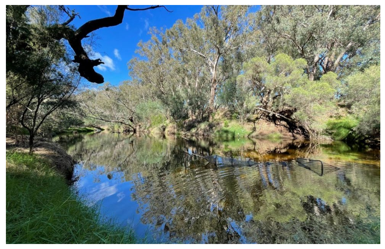
River health assessments across sections of the Murray River in Western Australia will provide a snapshot of ecological condition against which future restoration activities can be measured.