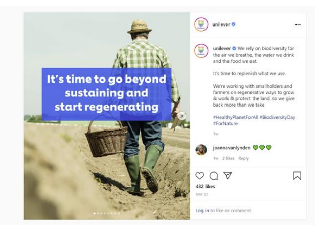
Figure 3 Unilever Twitter Account 2021

As companies seek to leverage their sustainability credentials through brand and product differentiation it is highly likely they will more interested in implementing or partnering in programs to support their producers to adopt more sustainable farming practices. For example, Coca Cola and <u>Project Catalyst</u>.